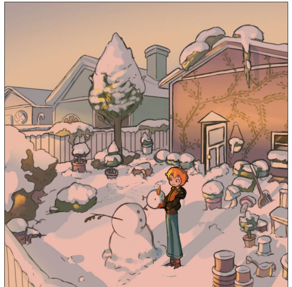
ARTWORK COURTESY OF DIMARIS CAMPOS RODRIGUEZ